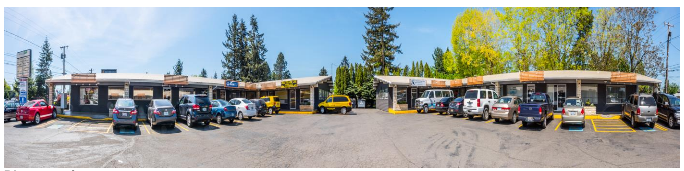
Plaza 122 in 2018

Plaza 122, built in 1962 as a single story (with basement) commercial/retail zoned office space, has 28,672 sg. ft. on a 1.43 acre lot. The property was in foreclosure, leased at only 66%, with deferred maintenance needs defined in an appraisal shared by the listing agency. The scoring of Plaza 122 proved financially feasible with a mid-range score for Category One, Property Value, with a price of $1.2 million and an estimated $200K in repairs and necessary tenant improvement upgrades. Category Two, Government Support, scored low for its potential for government support. Categories Three and Four for Housing and Partners scored high with the property's proximity to many churches, a library, fire station, a large high school, significant affordable housing units (only 35% of the area homes were owner-occupied, 90% of nearby school qualified for freereduced lunch program), significant ethnic diversity and strong neighborhood groups and associations. Categories Five, Six and Seven for Flexibility, Location and Neighborhood, which focused on property characteristics and location, scored high because of visibility, proximity to high traffic areas, multi-use possibilities and the possibility of diverse tenant use given a wide range of office sizes. Category Eight for Intangibles scored high for the curb appeal of the building as a mid-century modern building. Plaza 122 scored 34 out of a possible 40 points, with the lowest category being the potential for government support.