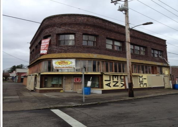
Phoenix Pharmacy in 1934